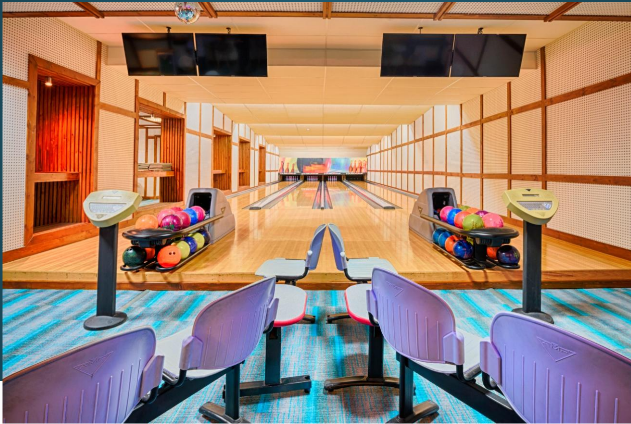
FOUR-LANE BOWLING ALLEY

IN HOUSE BOWLING, BILLIARDS, MINI FOOTBALL, DARTS AND AIR HOCKEY